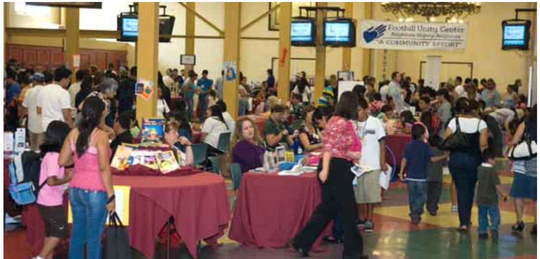
Last year's Back to School distribution.

The day also includes a ceramic art project with Paint N Play and dental and vision screenings by the USC School of