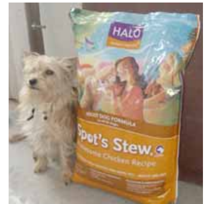
Our client Sara's dog Pirate likes Spot's Stew.

We need your donations of pet food or funds to keep this fledgling program growing. Our families in need and the pets they love thank you!